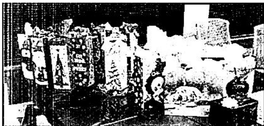
Wine wall & mystery gifts

The holiday party is also the launch of the Chapter's winter fundraiser. From a raffle basket, to wine wall and mystery gifts, we had it all.