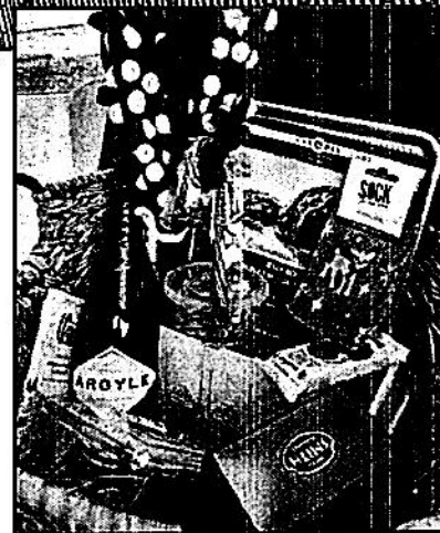
December Raffle Basket